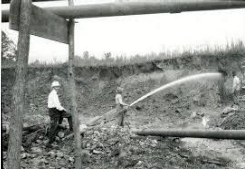
Figure 4: image from goldrushgallery.com

loosened sediment would be washed over riffles to separate the gold. Hydraulic mining was successful but devastating to the local environment. This process of hydraulic mining can be seen in figure 4: