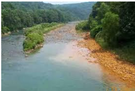
Figure 6: image from jan.ucc.nau.edu

Hard rock mining was also hazardous to the environment. The big fear is of acid-mine drainage. When buried rock is dug up, air and moisture can jumpstart chemical reactions that release acids and toxic metals such as sulfuric acid, arsenic and copper. These products can get into the groundwater and leach into nearby streams and lakes, altering the pH and affecting the ecosystem [Rastogi 2010]. Figure 6 shows an example of a creek in Pennsylvania affected by acid-mine drainage: