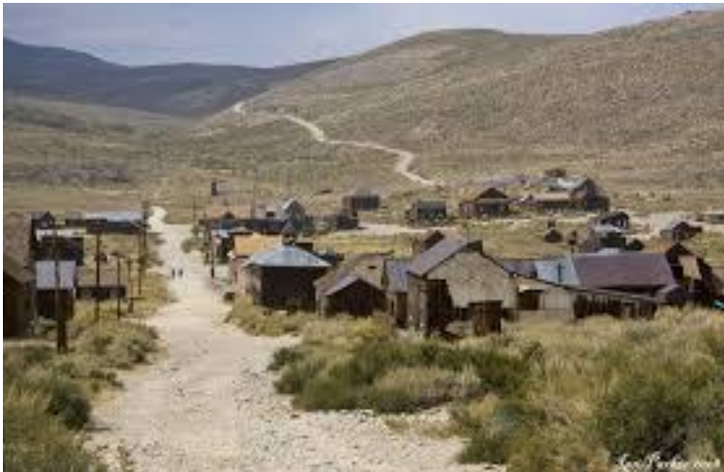
Figure 2:

As the west became populated with these forty-niners, mining camps and towns began to pop up. These communities ranged from being simple transient camps to being actual towns with shops, saloons and built houses. Life in both the mining camps and the “boomtowns” was dangerous. One such example is Bodie, a mining town in California. At its peak, Bodie had nearly 10,000 citizens living in the small hills near the mine [Bodie SHP]. The town, as it appears now, can be seen in figure 2: