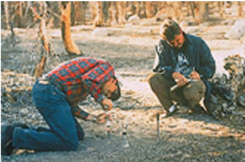
United States Geological Survey workers monitoring gas emissions at Horseshoe Lake Tree-Kill Zone. (Sorey 2000)

closed-dynamic-accumulation chambers in which the rate of change in concentrations was measured.” In 1996 another test was done in which an infrared gas analyzer received gas pumped in a continuous loop from and back into the chamber. The flux of these readings was calculated using a best-fit linear equation. Two monitoring wells were also drilled in the area “to learn more about variations in concentrations in the unsaturated zones and the chemistry and isotopic composition of the groundwater” (Farrar 1999, 6).