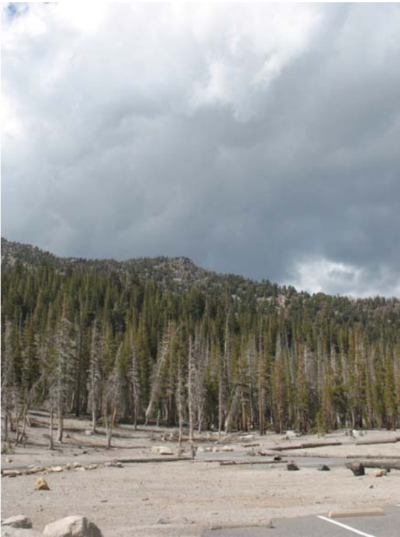
Horseshoe Lake Tree-Kill Zone.

People and animals trapped in low areas with poor ventilation may also fall victim to asphyxiation. Despite these dangers, the location of fumaroles and gas seeps can provide clues to both impending volcanic or seismic activity, as well as the locations of valuable hydrothermal deposits. In order to ensure the safety of patrons, populated regions, such as the famous Mammoth Mountain, are under close surveillance by the United States Geological Survey. Here, sulfur and carbon dioxide emissions are monitored and a hazard alert system has been established to warn nearby cities and resorts of impending volcanic activity. With such precautions, mankind can continue learning about the unique environments created by fumaroles and gas seeps, and perhaps even discover more about the origin of life on Earth.