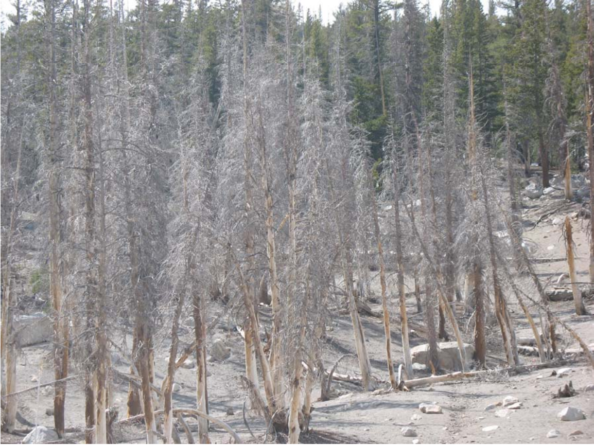
Trees killed by carbon dioxide asphyxiation at Horseshoe Lake Tree-kill Zone.

There are various hazards associated with the presence of gas seeps. Abnormal concentrations of a given gas can be toxic to plants and animals, including unsuspecting people. Carbon dioxide, one of the most prevalent gases in volcanic gas seeps, may accumulate in low lying areas around snow banks or inside buildings. When this occurs, a human or animal wandering into the area can be in danger of asphyxiation from the toxic gas. This is one reason snow caves, tents, natural caverns, and other low lying structures are exceptionally dangerous in gas-hazard areas (Farrar 1999). Plants, which are unaccustomed to such altered soil composition, can suffer tremendously from exposure.