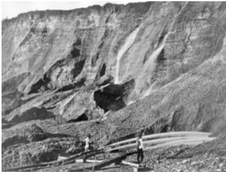
Hydraulic mining in California during the 1800s.

Another mining practice, besides just subsurface and pit mining, is hydraulic mining-where water is highly pressurized and shot out through hoses to wash gravel and other sediment into extraction facilities. This method is rarely practiced anymore though, due to the immense environmental damage it could cause-during the gold rush it destroyed hills and built up sediment in rivers which resulted in more flooding (MJC Geology Department).