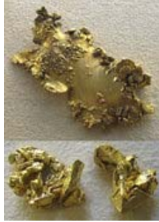
Gold, one of the precious materials (Wikipedia).

Kaolin is an industrial mineral and is also referred to as Kaolinite. It has microscopic triclinic crystallization, which means that the crystals are very small and there's no symmetry in the crystallization (Bangert, A.). It's formed through hydrothermal alteration and is a common clay. It's used in ceramics and as a filler in paper production (Basic Soil Science). As learned from Professor Hamburger, at some kaolin mines they also produce a large quantity of chert as a waste product. Chert is composed of fine-grained silica, and is sometimes known as flint, which is a variety of chert. It can be found in all colors and can be found in extensive sedimentary beds or mixed with limestone and dolomite (Eardley, 1965).