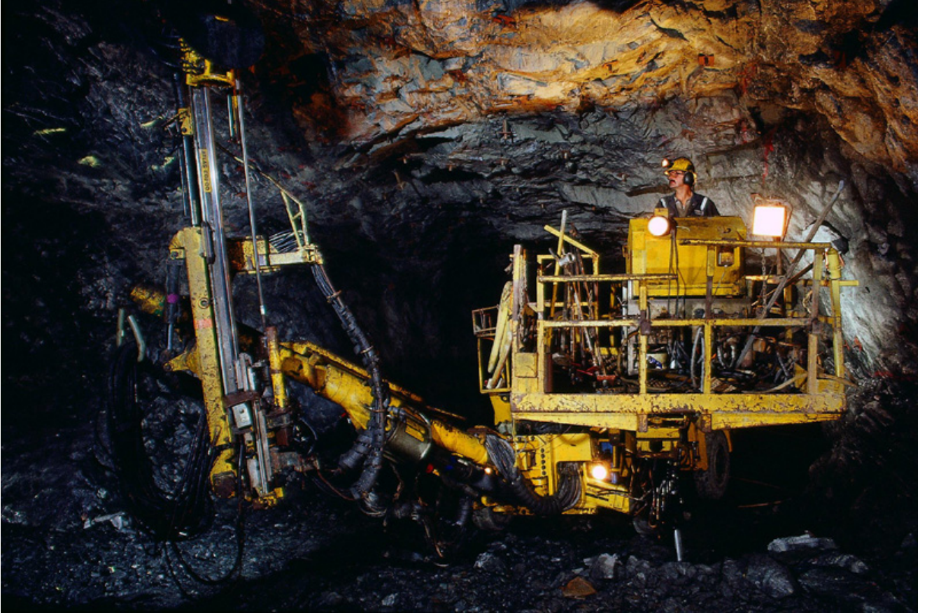
Vertical mining results in underground mines (Virtual Science Fair).

After exploration and development the companies can finally begin extraction. In order to extract material, holes are drilled and explosives detonated in the holes. The blasted material is then transported to the processing buildings. At the processing buildings the rocks are ground up into small pieces and go through various chemical and/or physical processes in order to separate the desired minerals from the surrounding rock. Naturally, depending on the individual mineral or rock, there may be differences to this process, but that's a rough generalization of the routine (Hardrock Committee).