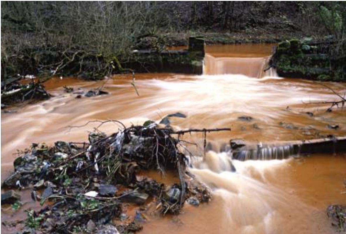
Example of river pollution, possibly caused by mining (Encarta).

water from the local groundwater supply for processing and to prevent the mines from getting flooded and this can lower the water table, which can result in less input for rivers and, in extreme cases, can result in rivers starting to dry up. With mines, come paved roads and other paved areas which leads to more runoff than natural. Though most new mines are by sites of already existing mines, they're also sometimes made in pristine environments where large amounts of human activity has never been seen before. Naturally, large scale human activities result in substantial disruption to these areas. Smelter exhausts result in air pollution, heavy machinery results in noise pollution, erosion increases as natural surfaces are disturbed, and dust levels increase as vegetation holding down topsoil is disturbed (Hardrock Committee).