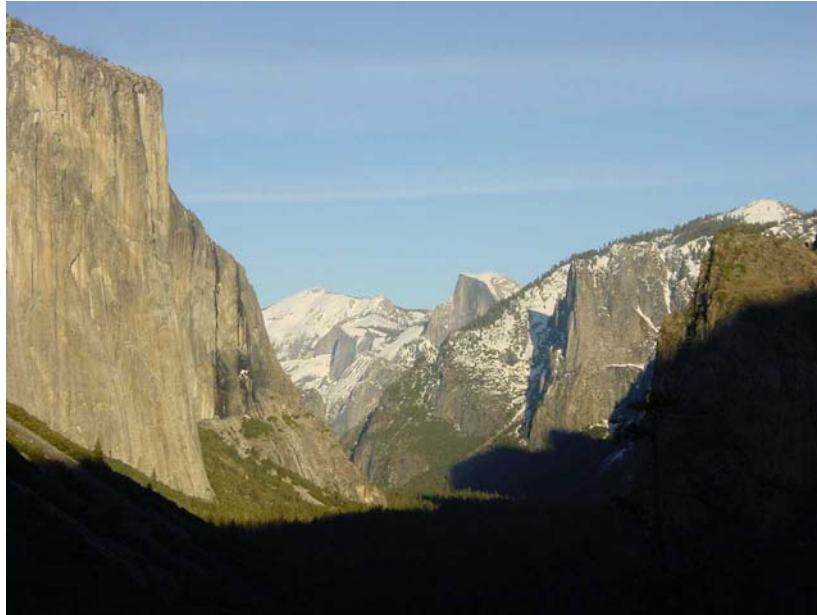
Figure 2: Yosemite Valley from the Wawona Tunnel Overlook. Half Dome is in the direct center. The towering 7000 ft El Capitan is in the front left. Roadside Geology of the Sierra Nevada

This picture depicts the deepened Yosemite Valley right after the Ice Age. Glaciers plowed on the granite, slate, and quartz with a pressure of a thousand tons to the square yard changing the V-shape to a flattened U.