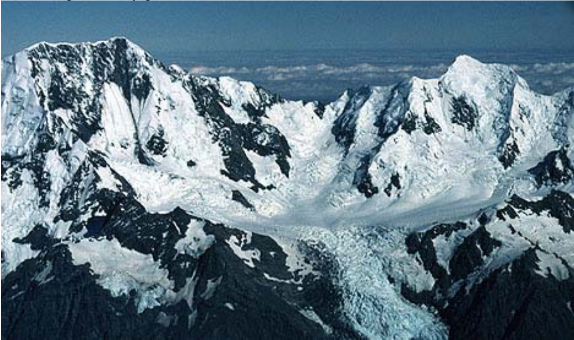
Figure 8. Modern day glaciers covering the Grand Plateau, New Zealand. Mt. Cook stands on the left. Thousands of years from now, The Grand Plateau will probably melt into a U-shaped valley like its mirroring historical glacier-valleys.

Picture of present day glaciers in New Zealand: