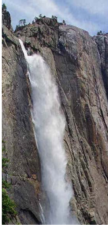
Figure 5. Upper Yosemite Falls thundering down it's arduous descent.