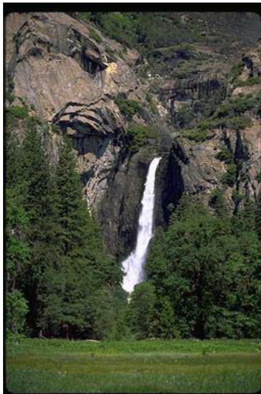
Figure 6. Bridal Veil drops 1612 feet, another example of a hanging waterfall. Yosemite pictures.com