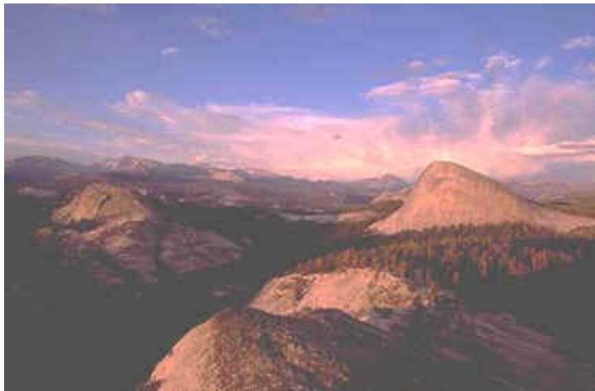
Figure 4. Fairview Dome stands brilliantly in the sunset to the right. Yosemitepictures.com

by their imperfect patches. Fairview hosts some erratic or foreign boulders that drifted on ice from twelve miles away. The Tuolumne Glacier sculpted Mounts Dana, Lyell, McClure, Gibbs, Conness, and the Hoffman Range. “These bald, westward-leaning rocks, with their rounded backs and shoulders toward the glacier fountains of the summit-mountains, and their split, angular fronts looking in the opposite direction, explain the tremendous grinding force with which the ice-flood passed over them, and also the direction of its flow”(Muir 160).