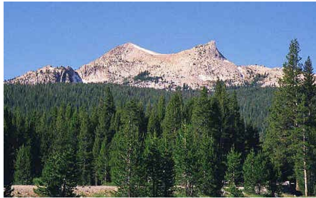
Figure 3. The sheepish Unicorn Peak rises to the south of Tuolomne Meadows.

The Tuolumne Glacier was the longest and most influential of all the Sierra ice rivers. It was not restricted to a river canyon, but spread itself out sixty miles and 2000 feet deep. The Tuolumne Glacier produced glacial “ moulin ” or glacial mills, holes formed by carving rocks. Also, it founded Liberty Cap, Mount Broderick, Unicorn, and Cathedral Peaks, “ roches moutonnees ,” or mutton rock, which are huge rounded domes with peaks that survived the glacier’s path.