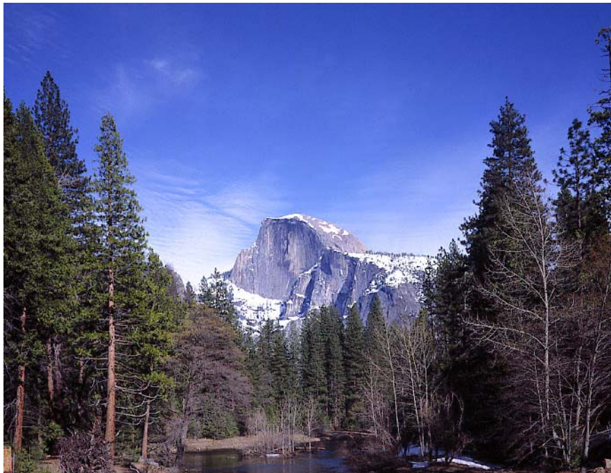
Figure 7. Half Dome from Sentinel Bridge stands alone...its fitting mate fallen to the woo of a powerful glacier.

The Hoffman glacier worked on depressing the basin as it declined 5 miles. It combined with the Tenaya Glacier to carve Half Dome, North Dome South Dome and other pieces of the head of the valley. The domes "... are miles in extent, only slightly interrupted by spots that have given way to the weather, while the best preserved portions reflect the sunbeams like calm water or glass, and shine as if polished afresh every day, notwithstanding they have been exposed to corroding rains, dew, frost, and snow measureless thousands of years"(Muir 156). As the glacier moved over Half Dome, it polished its face, and broke off the dome face leaving a steep cliff.